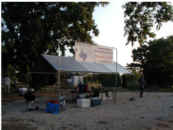
Good food is always on the list at the WCARC Field Day Event.