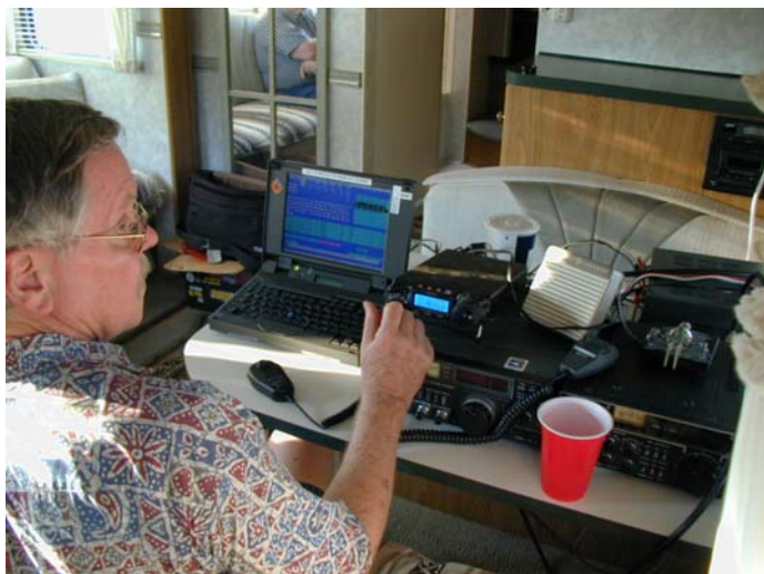
The satellite station in operation...