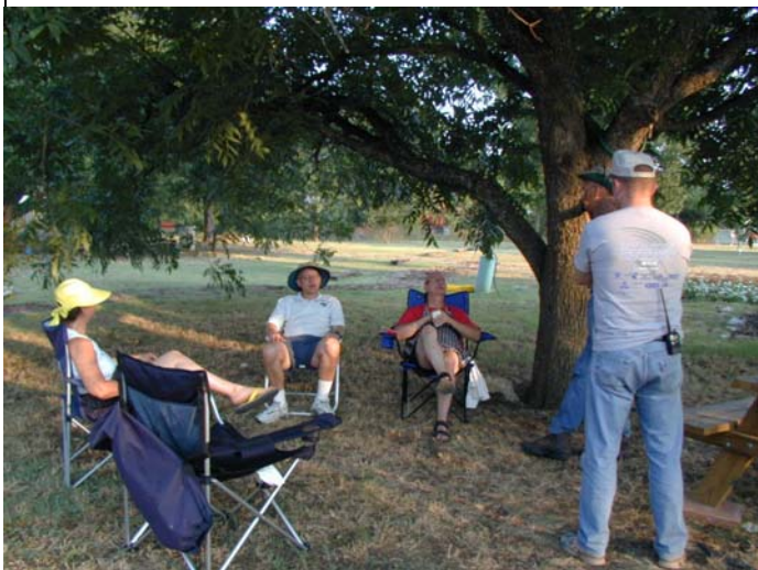
Fellow club members kicking back, discussing the ones that got away.