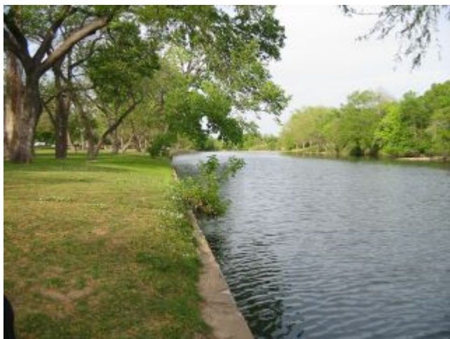
San Gabriel Park—Georgetown, TX

http://www.hornucopia.com/contestcal/contestcal.txt